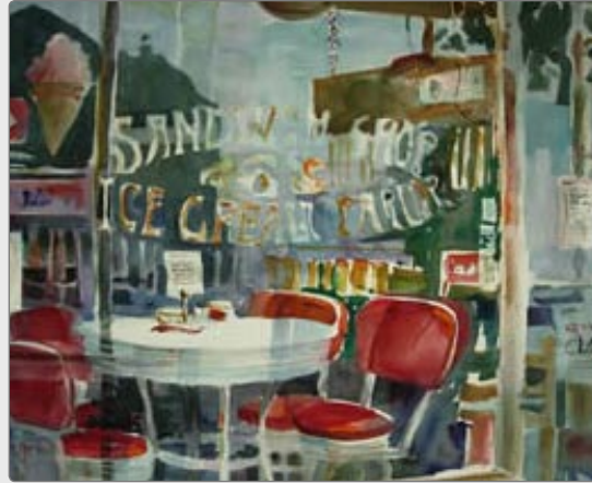
"Ice Cream Parlor"